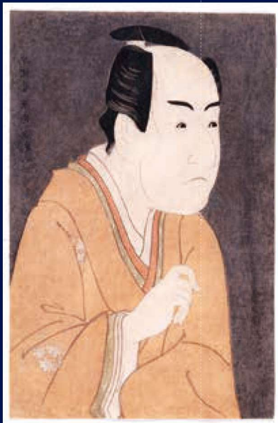
Ichikawa Monnosuke II as Date no Yosaku by Toshusai Sharaku