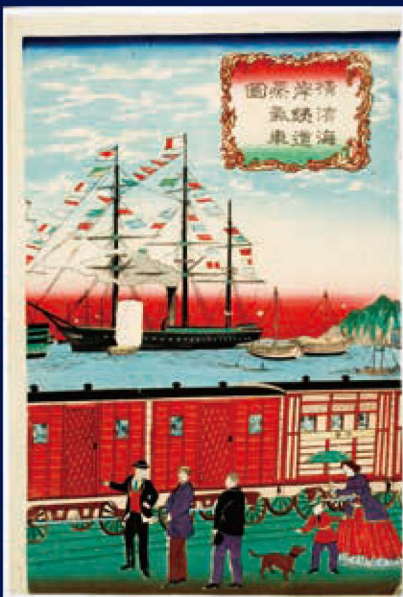
Steam Locomotive in Yokohama by Utagara Hiroshige III