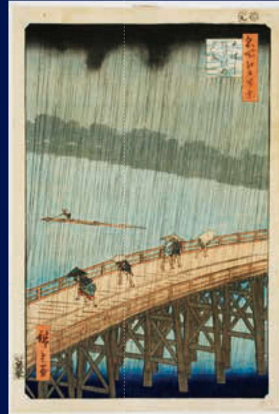
One Hundred Famous Views in Edo—Sudden Shower over Shin-Ohashi Bridge and Atake by Utagawa Hiroshige I