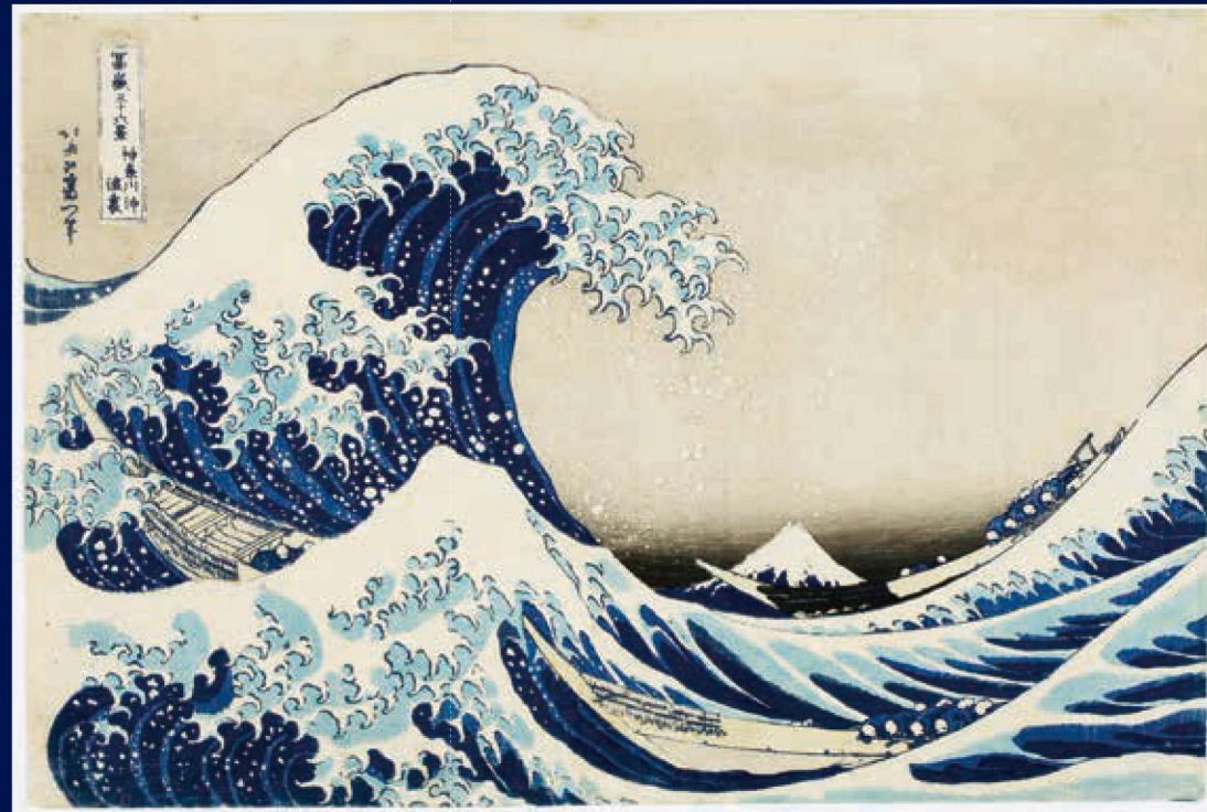
Thirty-six Views of Mt. Fuji—The Great Wave off Kanagawa by Katsushika Hokusai