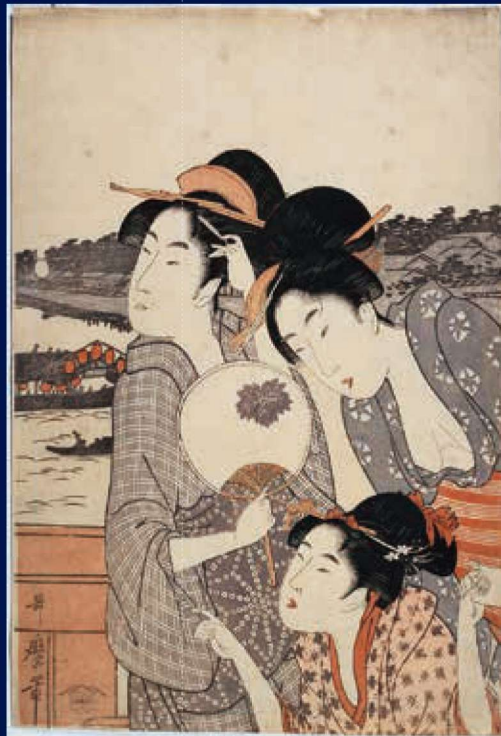
Ryogoku River Opening by Kitagawa Utamaro