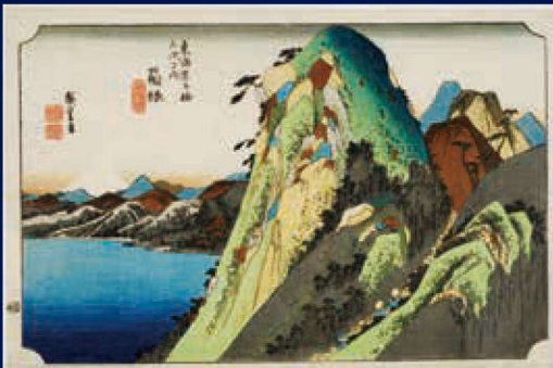
The 53 Stations of the Tokaido—Hakone by Utagawa Hiroshige I