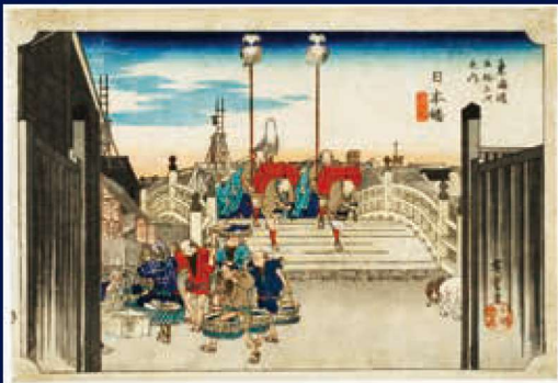
The 53 Stations of the Tokaido—Nihombashi by Utagawa Hiroshige I