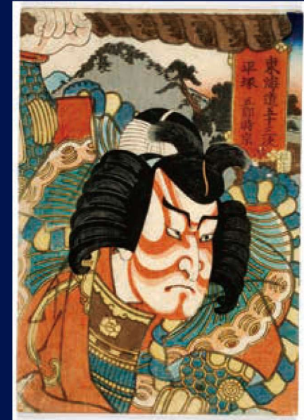
The 53 Stations of the Tokaido—Hiratsuka—Goro Tokimune by Utagawa Toyokuni III