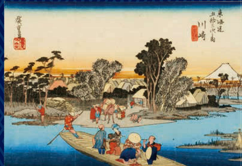
The 53 Stations of the Tokaido—Kawasaki by Utagawa Hiroshige I

KAWASAKI UKIYO-E GALLERY SAITO FUMIO COLLECTION