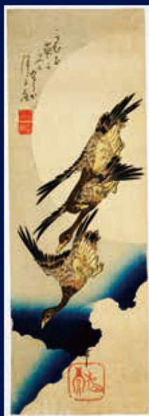
Wild Geese Flying under the Full Moon by Utagawa Hiroshige I