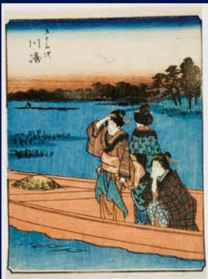
People Drawn in The 53 Stations of the Tokaido—Kawasaki by Ukagawa Hiroshige I